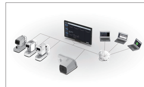
Network in Huvitz Integrated Image Server(HIIS-1)