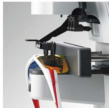
Mirror Lens Measurement