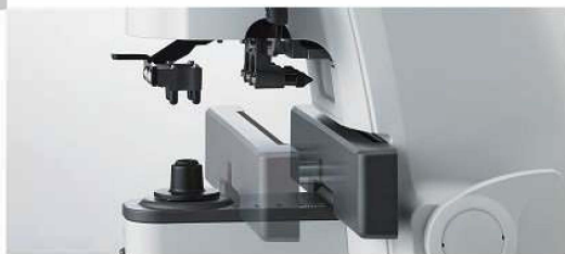
Minimize the Distance between PD Bar and Lens Support