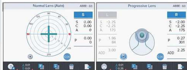
Auto Lens Recognition

New bright and easily visible Graphical User Interface(GUI) that gives feedback and guidance for easy-to-use operation.